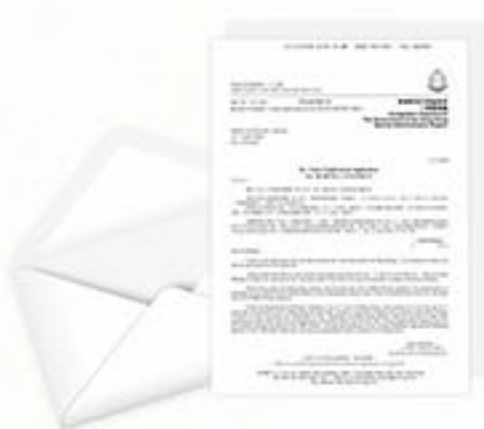
Approval Letter from Immigration Department