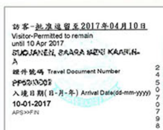
White Visitor Visa Slip - if already in Hong Kong -