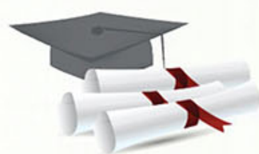
Proof of Academic Qualifications