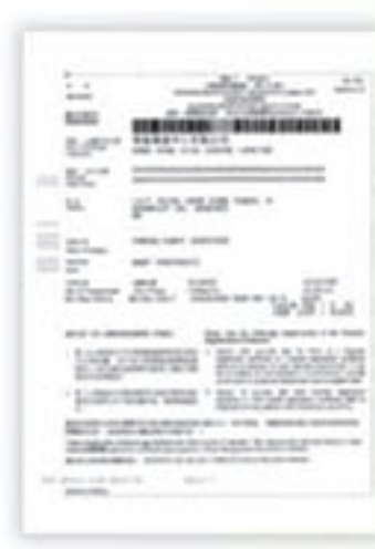
Updated Business Registration Certificate