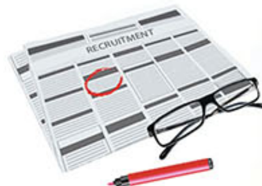
Local Recruitment Exercise - Job Posting & Candidates' CVs-

Employer will need to provide additional documents if the Company didn't receive any Employment Visa Approval in the last 18 months