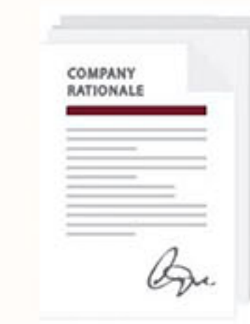
Letter introducing the Company - Business Plan -