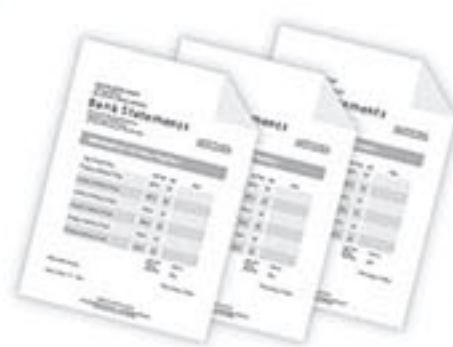
Bank Statements - latest 3 months -