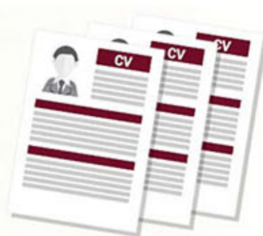
Up to date Resume