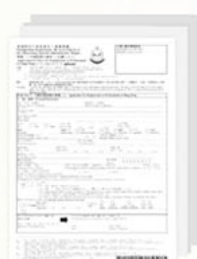
Application Form ID990A