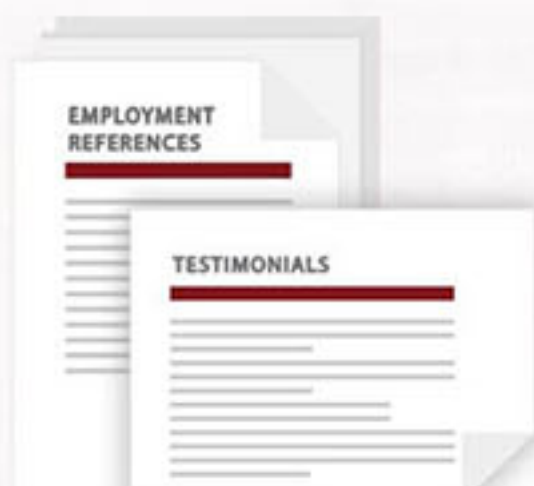
Employment References and Testimonials