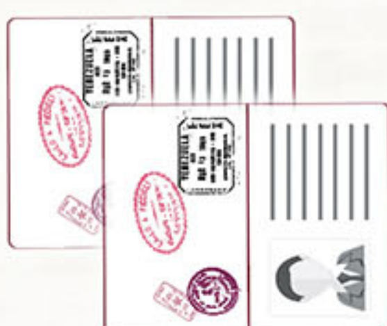
Passport - Applicant & each family member -