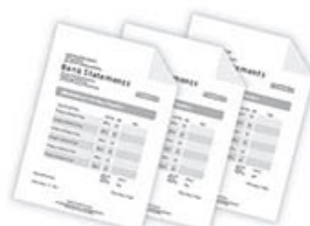
Bank Statements - latest 3 months -