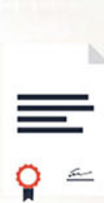
Birth or marriage certificates for dependants