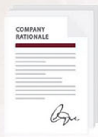
Letter introducing the Company - Business Plan -