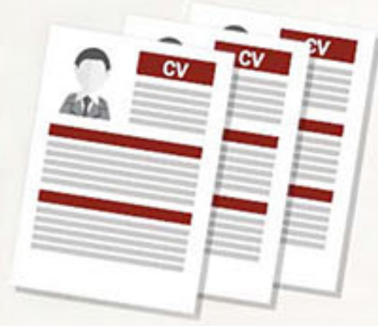
Up to date Resume