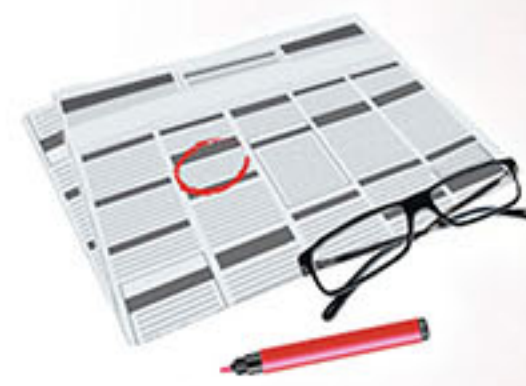
Local Recruitment Exercise - Job Posting & Candidates' CVs-

Employer will need to provide additional documents if the Company didn't receive any Employment Visa Approval in the last 18 months