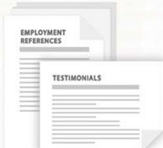
Employment References and Testimonials