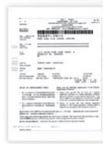
Updated Business Registration Certificate